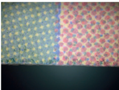
Cutting of printed paper (80 g / m 2 ) Speed: 40 m / min

This work was done in cooperation with CHRISTOPH DEININGER, Ingenieurbüro für optische Technologien in Reutlingen, Germany